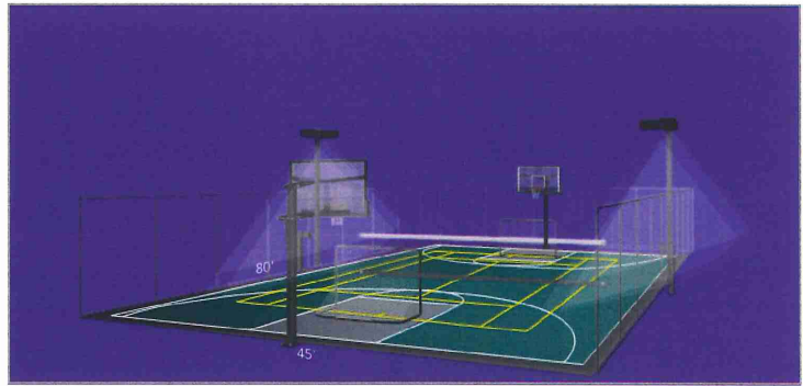
CONCEPT IMAGE OF SPORT COURT

The court would be approximately 80' x 45' (3600 sqft), roughly the size of a basketball court. It would be surrounded by soft netting to contain play within the designated area. The court would be lined for basketball, floor (ice) hockey, volleyball, tennis and badminton, with opportunities for other games. A dasher board (10") would line the court perimeter to allow for both floor hockey and ice hockey, should the community want to flood the court in the winter.