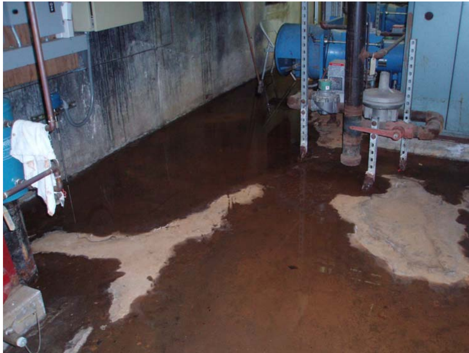
Picture 1.11. View of Smith basement boiler room, showing water infiltration.