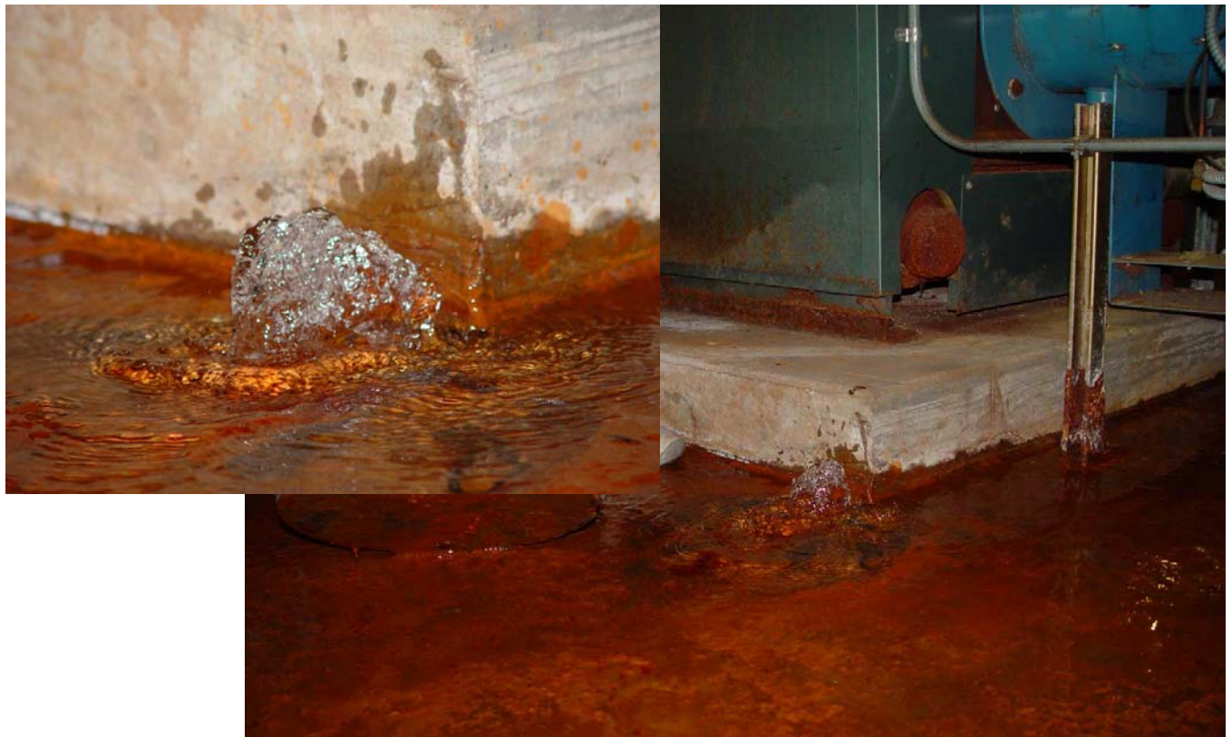
Picture 1.12. Smith basement, showing water damage to boiler (typical)