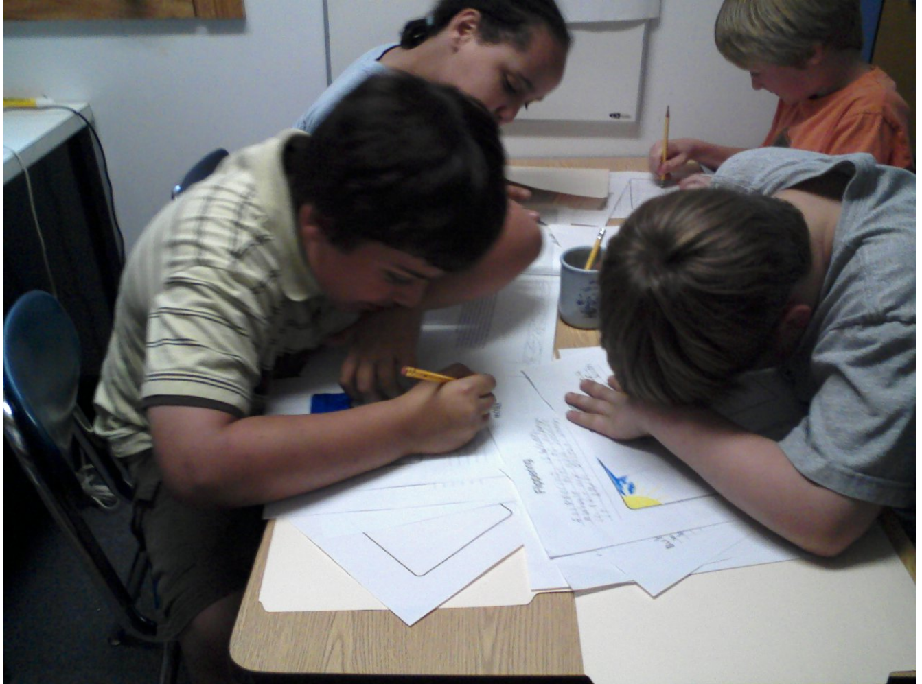
Picture 7.1 Special Education services delivered in inadequate area.