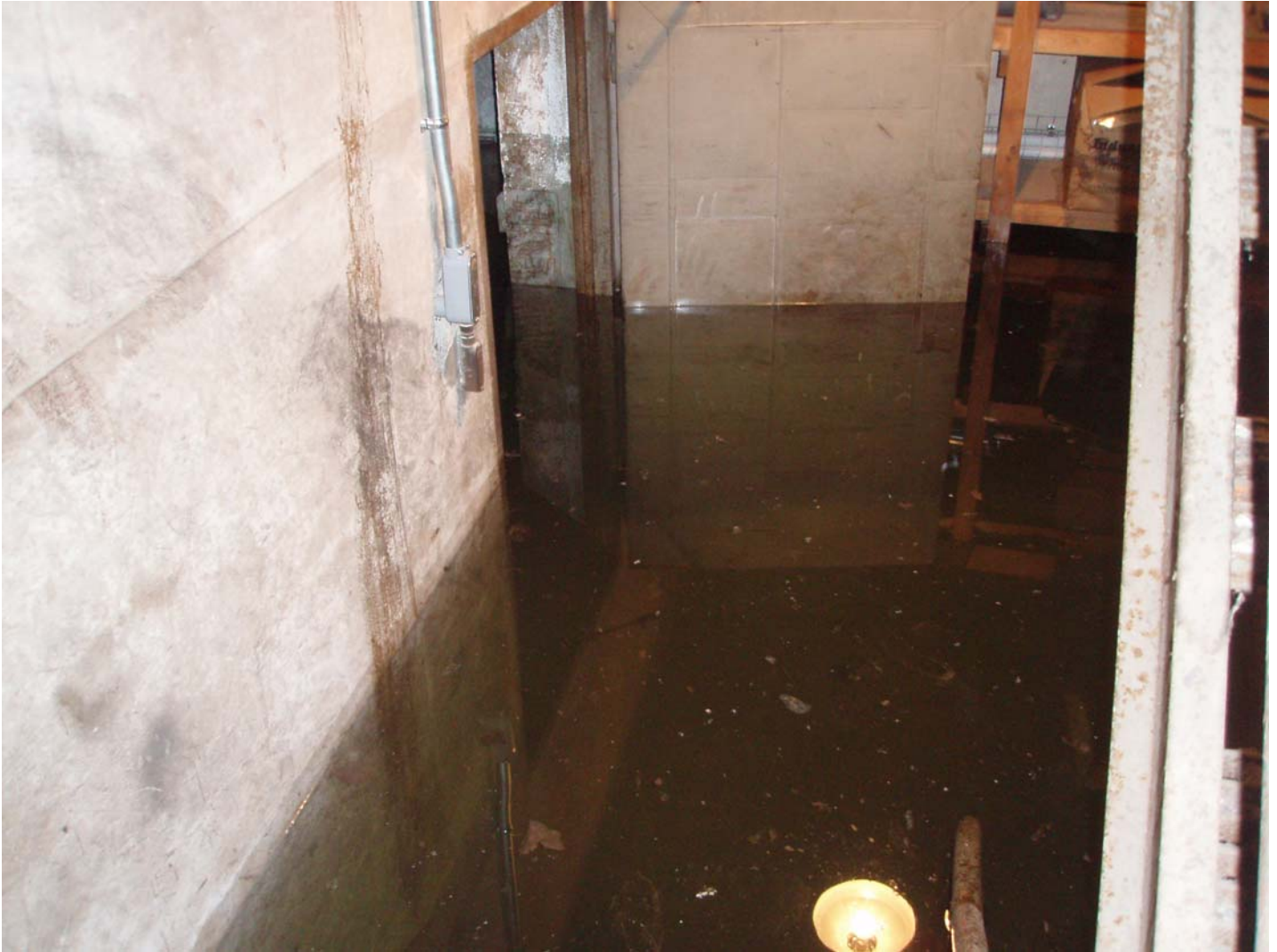
Picture 1.14. View of stairwell to the Smith basement taken on March 15, 2010. Water is 53 inches above the floor level.