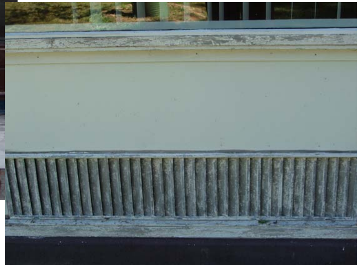
Pictures 1.51 through 1.53. Condition of Brooks window curtain walls, showing deteriorated panels and rotting trim.