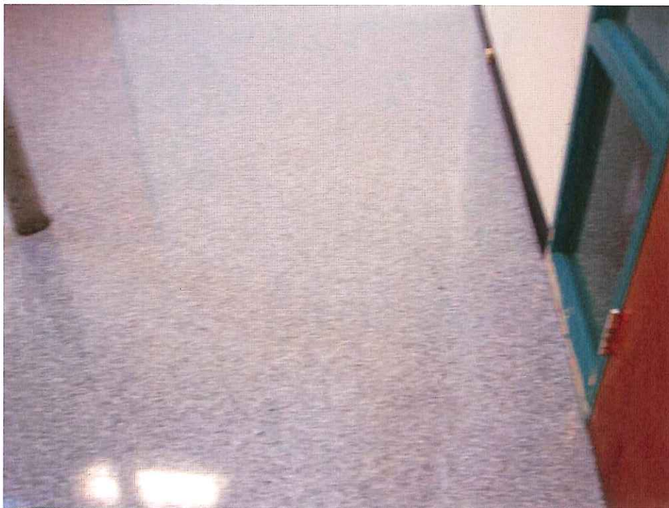
Central Office support area - after