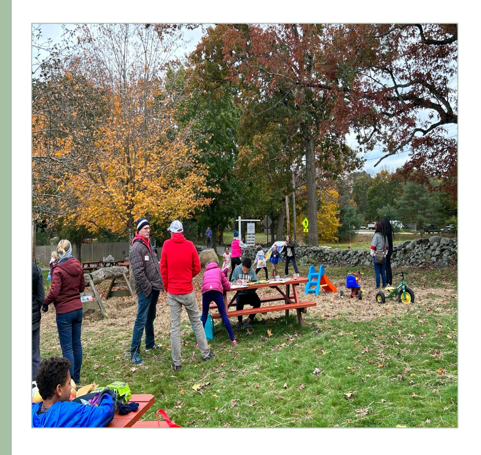
Fall SEPAC Social at Codman Farm