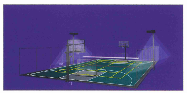
CONCEPT IMAGE OF SPORT COURT

The court would be approximately 80' x 45' (3600 sqft), roughly the size of a basketball court. It would be surrounded by soft netting to contain play within the designated area. The court would be lined for basketball, floor (ice) hockey, volleyball, tennis and badminton, with opportunities for other games. A dasher board (10") would line the court perimeter to allow for both floor hockey and ice hockey, should the community want to flood the court in the winter.