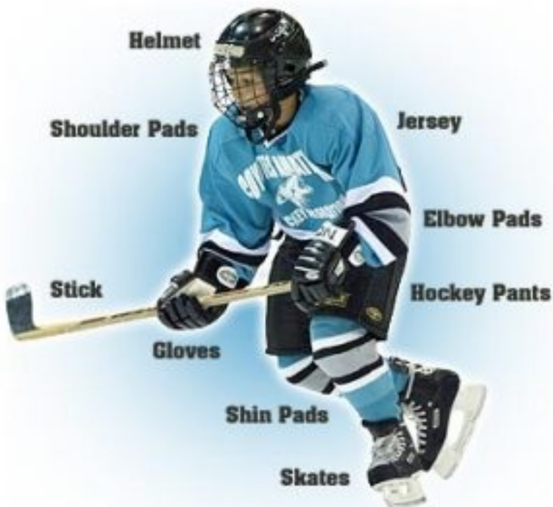
Diagram of the pads